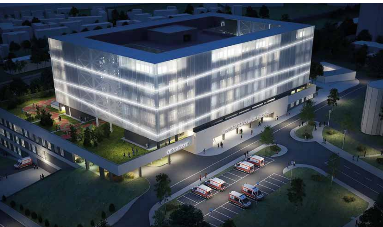
Preliminary design of the University Children's Hospital Tiršova project.

When a child falls ill, specialised medical care is often required. This is precisely the type of care that the University Children's Hospital Tiršova provides. Located in Belgrade, the capital of Serbia, the hospital is a landmark in the region, known for its excellence in paediatric care.