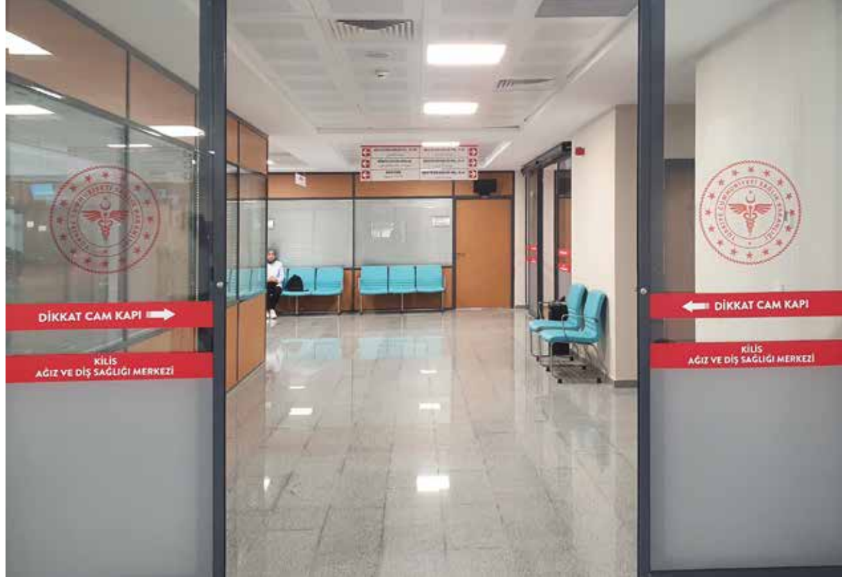
Inside the new EU-funded hospital at Kilis, Türkiye.

To address the needs of refugees and their host communities, the EU and Türkiye established in 2015 a coordination mechanism: the EU Facility for Refugees in Türkiye. The facility financed the new hospital through a €50 million contribution.